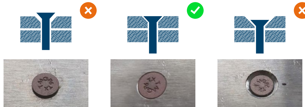
Image processing software based on artificial vision

3D surface inspection with pinpointing and identification of defects